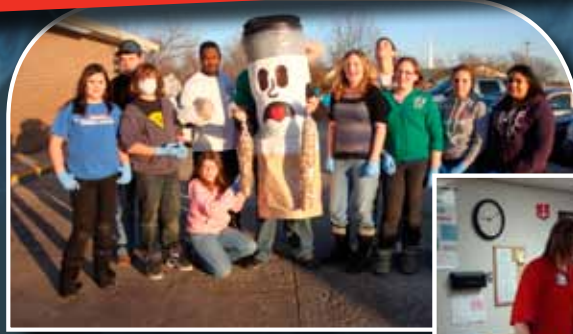
"Ciggy Butts" and members of SWAT hold up the many bags of cigarette butts picked up at WCH.