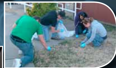
Porter High School SWAT members worked hard! They covered several areas including the Medical Office Building.