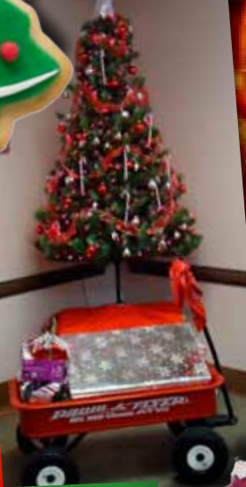
Santa used a 4-wheel wagon to deliver WCH's door prizes.