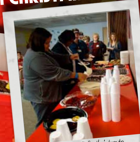
A line of employees wait for their turn to choose from delicious candies plus eggnog and spiced cider.